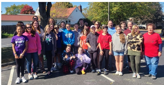
2022 Mission Trip